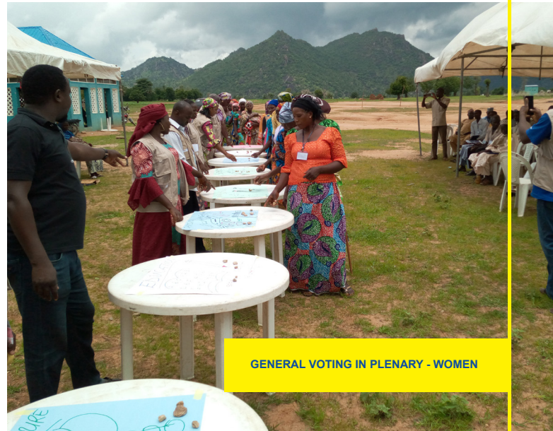
GENERAL VOTING IN PLENARY - WOMEN

Sapphire, Madrid trees, irrigable low plains (Fadama) are some of our major natural resources. Secondary and Primary Schools as well as civic centres are few amongst our social resources in the ward. Lack of unity, absence of constitutional roles for traditional leaders, poverty, insecurity and unemployment as some of our major challenges. Our most pressing problems include lack of basic infrastructures like culverts over major rivers along Mubi-Bahuli road, dilapidated school structures and lack of portable drinking water in some of our communities.