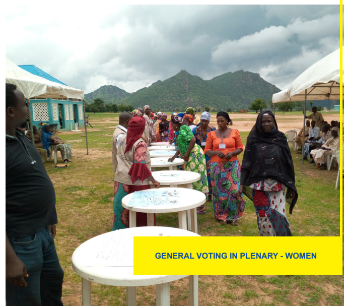
GENERAL VOTING IN PLENARY - WOMEN