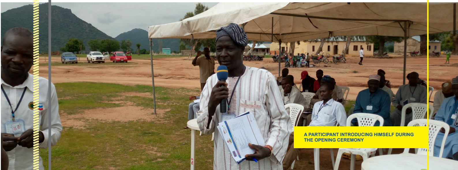
A PARTICIPANT INTRODUCING HIMSELF DURING THE OPENING CEREMONY