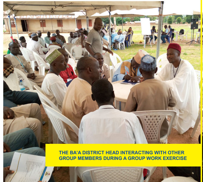
THE BA'A DISTRICT HEAD INTERACTING WITH OTHER GROUP MEMBERS DURING A GROUP WORK EXERCISE

The tangible results of the Bahuli ward CDP process and especially the CDP session is this Ward Development Plan. This Plan and its content were validated by the representatives of the Bahuli ward.