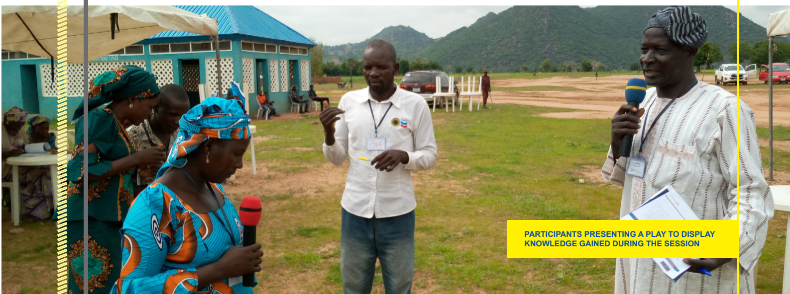
PARTICIPANTS PRESENTING A PLAY TO DISPLAY KNOWLEDGE GAINED DURING THE SESSION