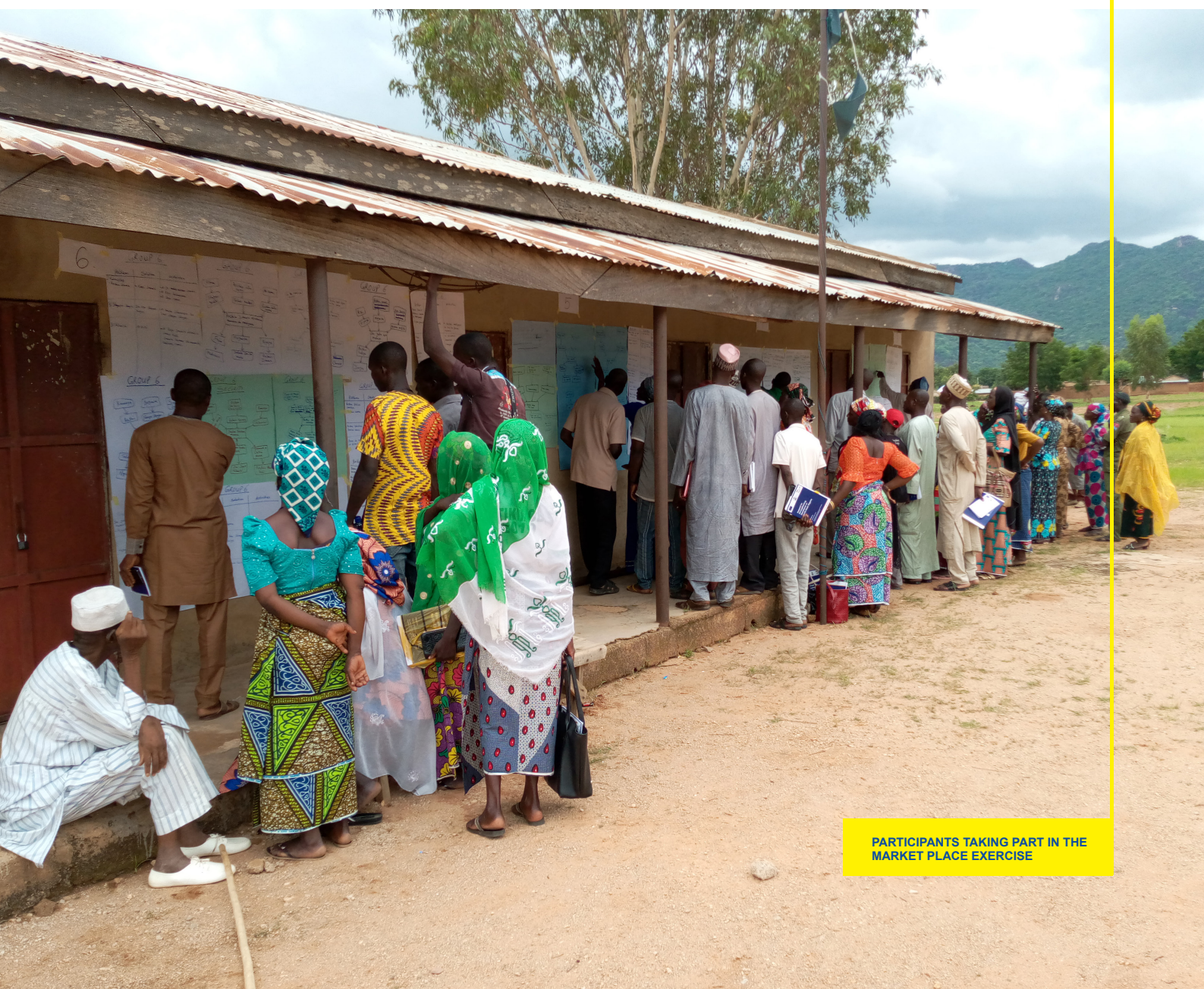
PARTICIPANTS TAKING PART IN THE MARKET PLACE EXERCISE

Every participant got 3 stones and was free to distribute these stones on the identified problems within their respective sector in order to emphasize the participant's prioritization.