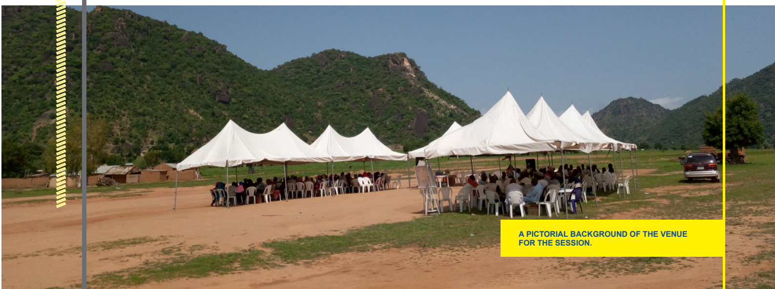
A PICTORIAL BACKGROUND OF THE VENUE FOR THE SESSION.