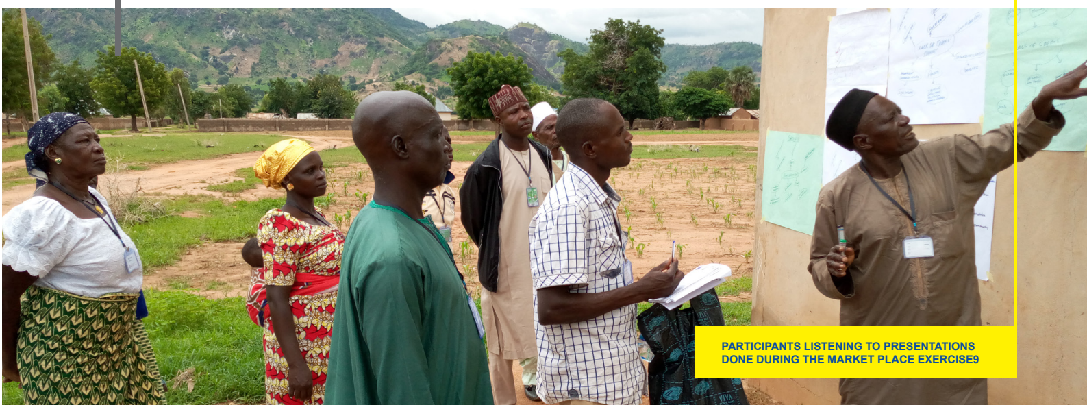
PARTICIPANTS LISTENING TO PRESENTATIONS DONE DURING THE MARKET PLACE EXERCISES