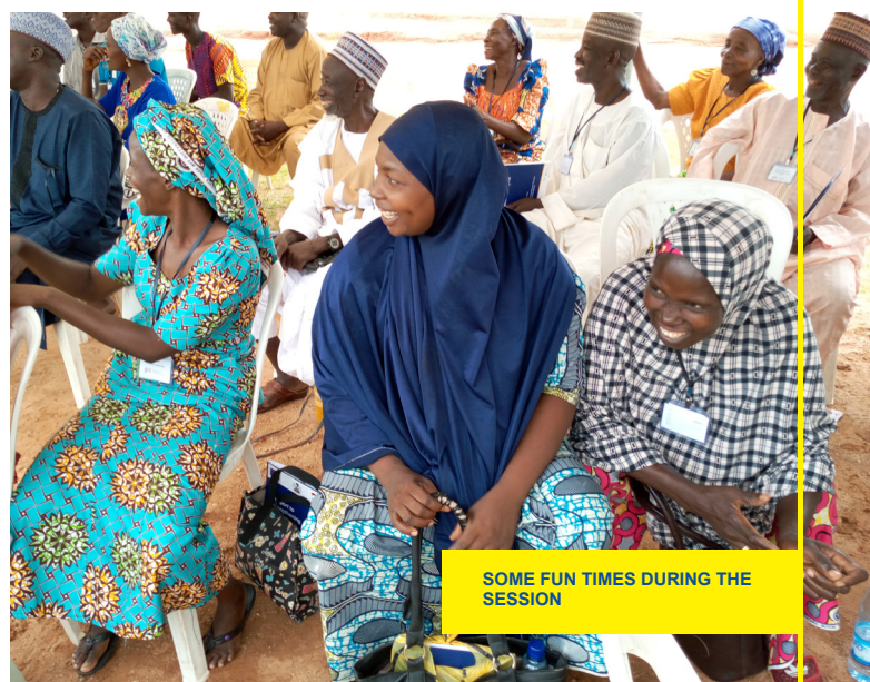
SOME FUN TIMES DURING THE SESSION

In the tables below, you will find a summary of our discussions: