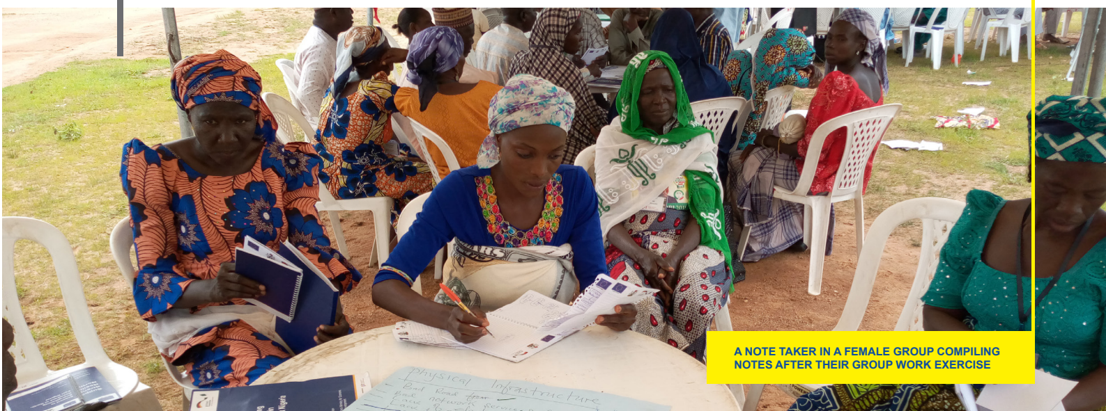
A NOTE TAKER IN A FEMALE GROUP COMPILING NOTES AFTER THEIR GROUP WORK EXERCISE