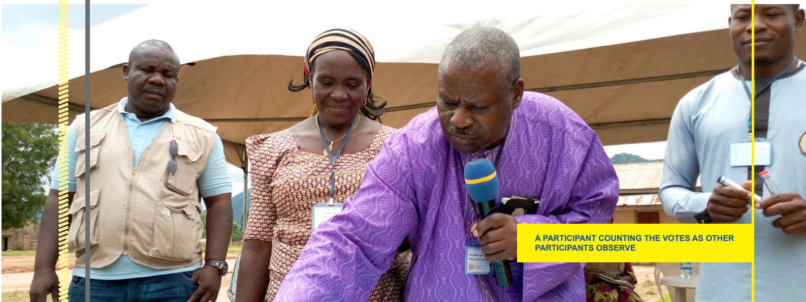
A PARTICIPANT COUNTING THE VOTES AS OTHER PARTICIPANTS OBSERVE