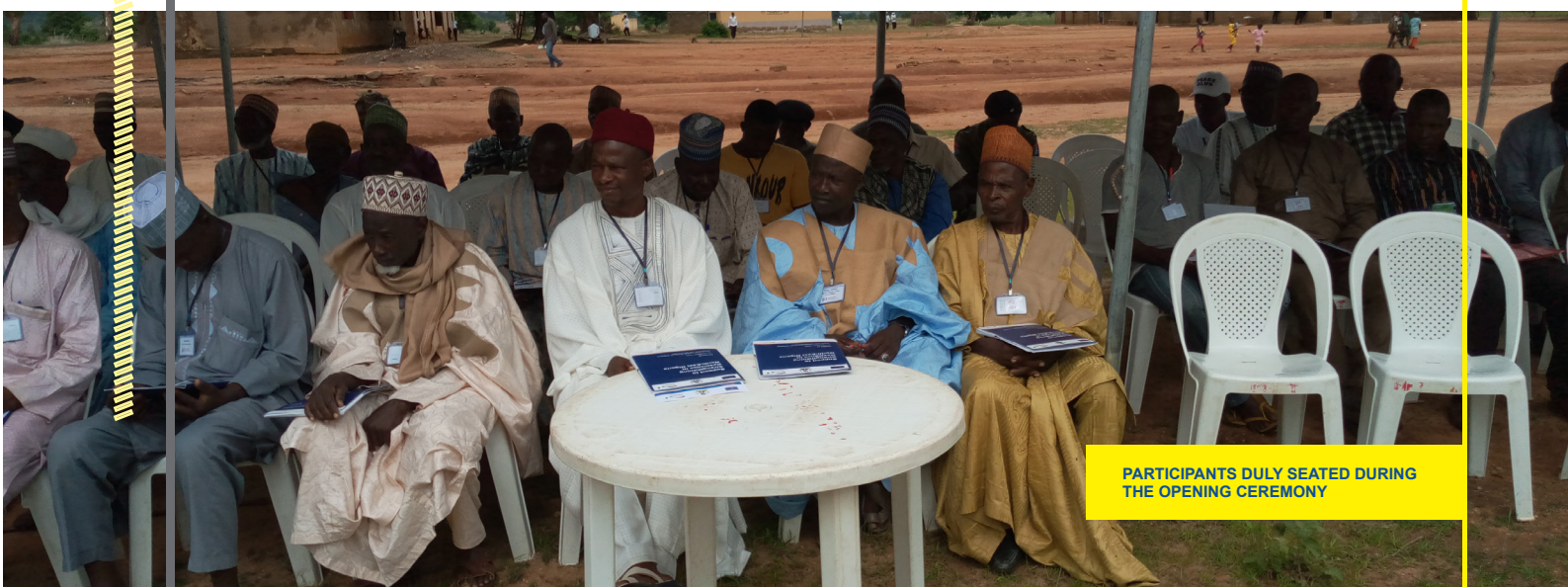
PARTICIPANTS DULY SEATED DURING THE OPENING CEREMONY