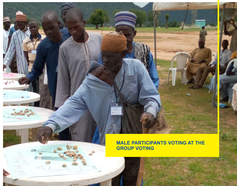
MALE PARTICIPANTS VOTING AT THE GROUP VOTING