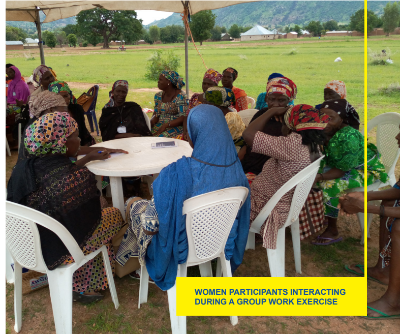
WOMEN PARTICIPANTS INTERACTING DURING A GROUP WORK EXERCISE

The CDP process has provided the opportunity for community stakeholders to come together under one umbrella to discuss and analyze their livelihoods, problems, causes, strategies and potential solutions. It is a process where members of a community are active participants in their problem identification, analysis of developmental issues affecting them and brainstorming on solutions to solve the problems. This is done while putting the peculiarity of their communities at the center of all the efforts. While stakeholder sensitization, ward analysis and community mobilization played a crucial role in the CDP process, the Community Development Planning Session itself is the heart of the process. This 4-day session is akin to the village/town meetings where members of the community come together to discuss issues that affect their development and plan activities to overcome those development gaps. The major objectives of the CDP sessions are: