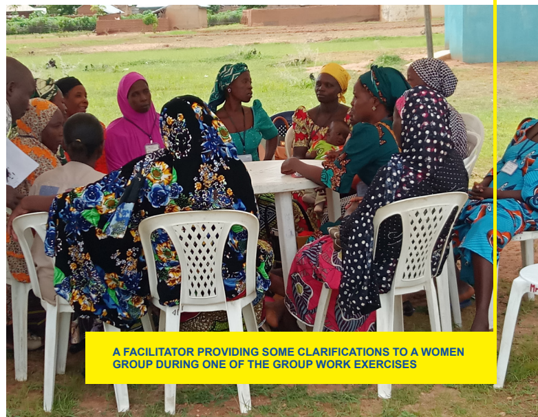
A FACILITATOR PROVIDING SOME CLARIFICATIONS TO A WOMEN GROUP DURING ONE OF THE GROUP WORK EXERCISES