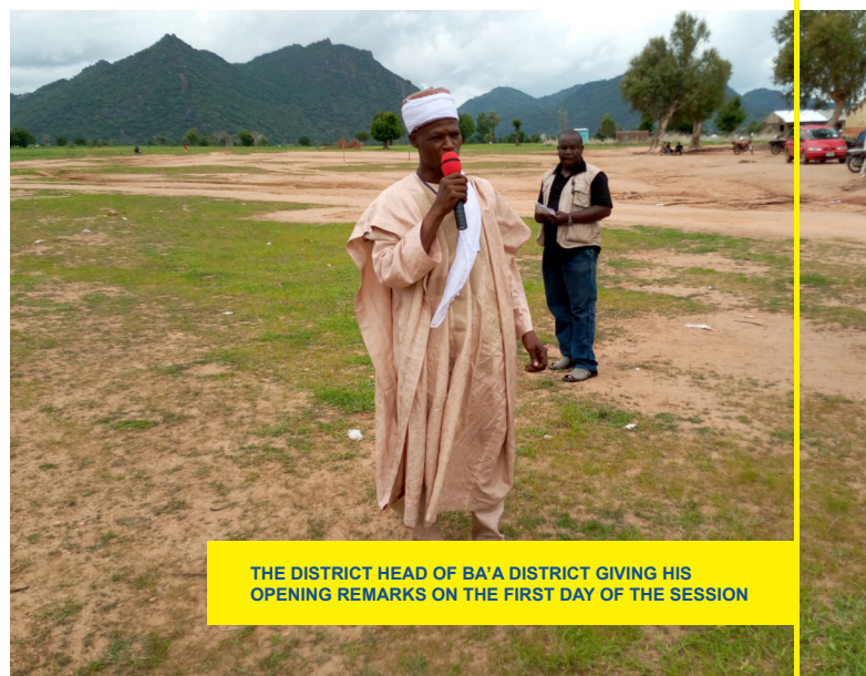
THE DISTRICT HEAD OF BA'A DISTRICT GIVING HIS OPENING REMARKS ON THE FIRST DAY OF THE SESSION