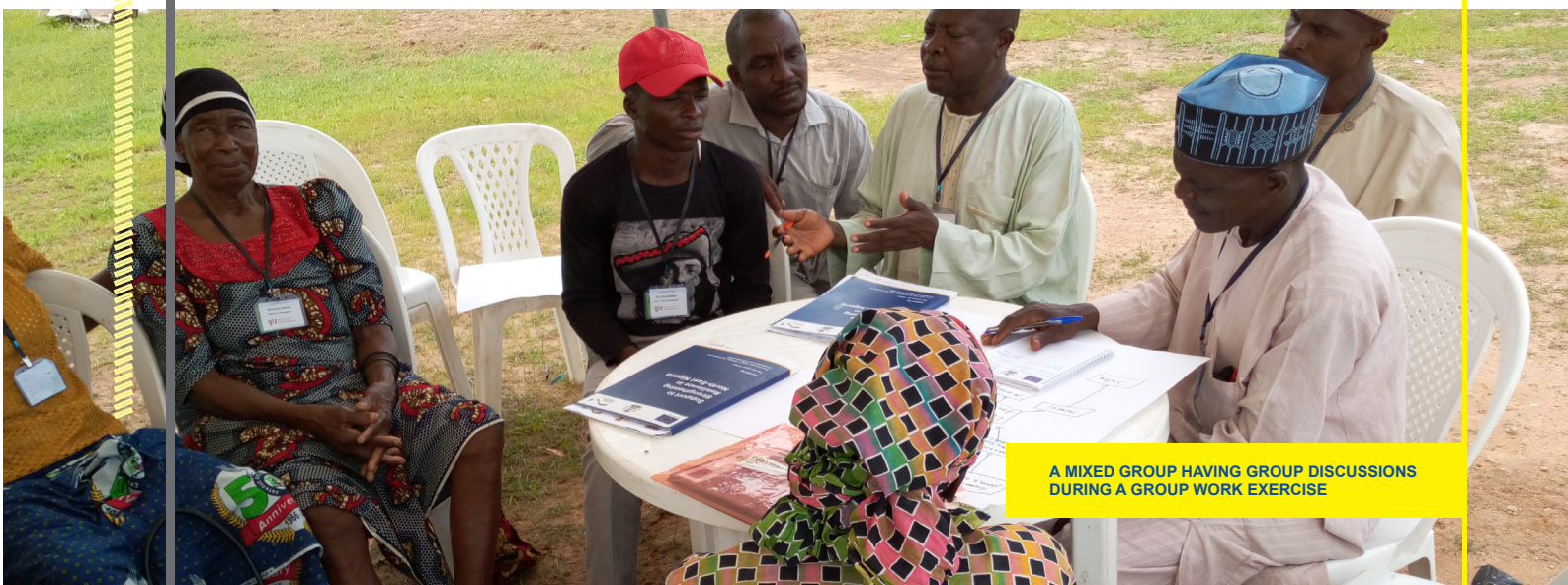
A MIXED GROUP HAVING GROUP DISCUSSIONS DURING A GROUP WORK EXERCISE