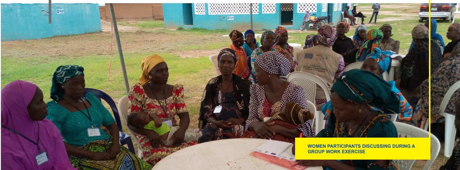
WOMEN PARTICIPANTS DISCUSSING DURING A GROUP WORK EXERCISE