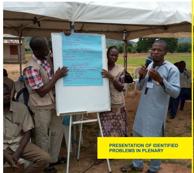
PRESENTATION OF IDENTIFIED PROBLEMS IN PLENARY