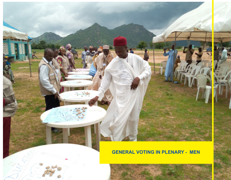
GENERAL VOTING IN PLENARY - MEN